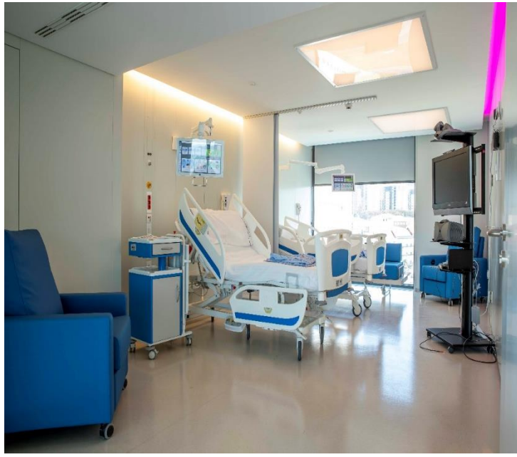
Double experimental room