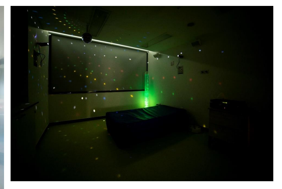
Multi-sensorial stimulation room