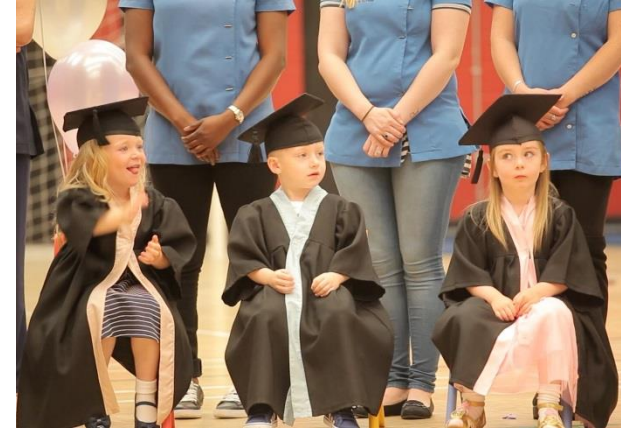
“Graduation” at the North Wall Community Development Project Creche

Vibrant local communities in Ireland turning their own visions into realities