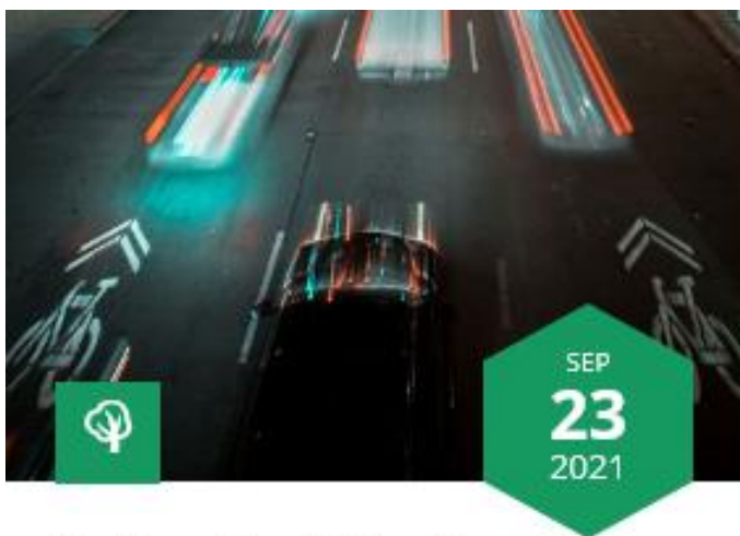
Cycling cities V: Cost-benefit comparisons of bicycles...