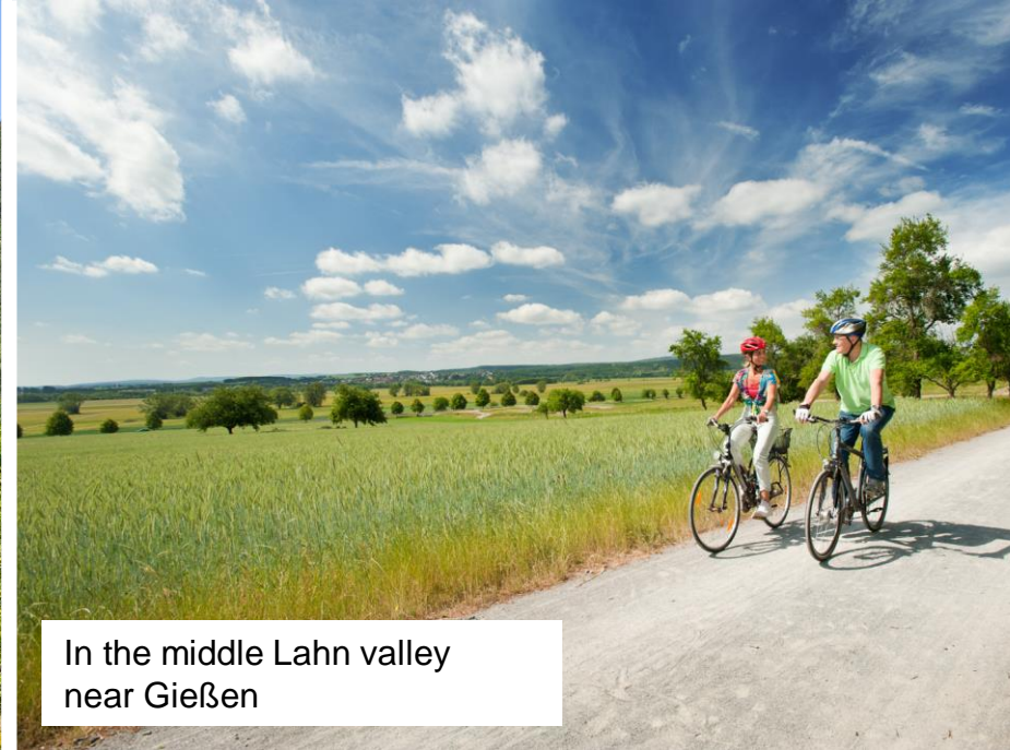
In the middle Lahn valley near Gießen