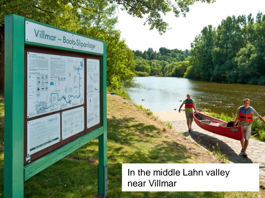
In the middle Lahn valley near Villmar