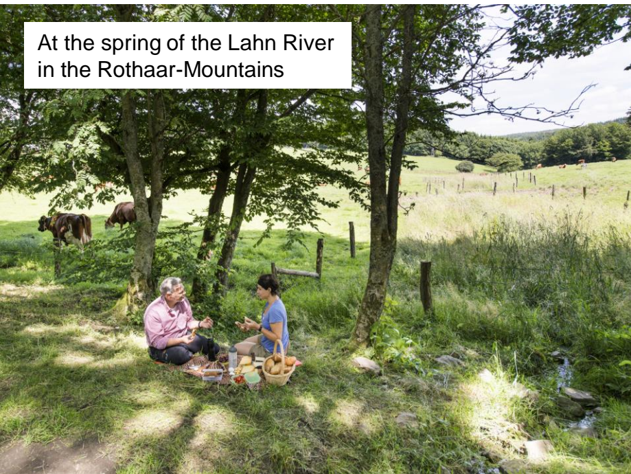
At the spring of the Lahn River in the Rothaar-Mountains