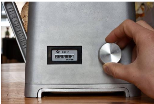
Figure 2 The Optimist Toaster

Circular/sustainable design is also gaining ground in Europe and beyond. Design is central if products are to be resource efficient, long-lasting, easily repairable and recyclable. For example, the UK Centre for Sustainable Design is an active promoter of the concept. The UK Agency of Design has developed a Circular Economy Design Tool offering a good basis for exploring circular economy design opportunities . The agency developed a product – the Optimist Toaster – which embodies circular economy ideas such as prolonging the life of the product; choosing an easily recyclable material – aluminium; and using very few parts that can break.