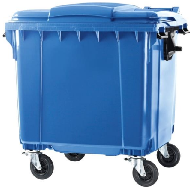
Mixed waste 2x/week