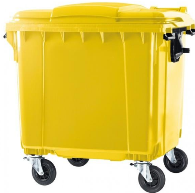
Selective waste 2x/week