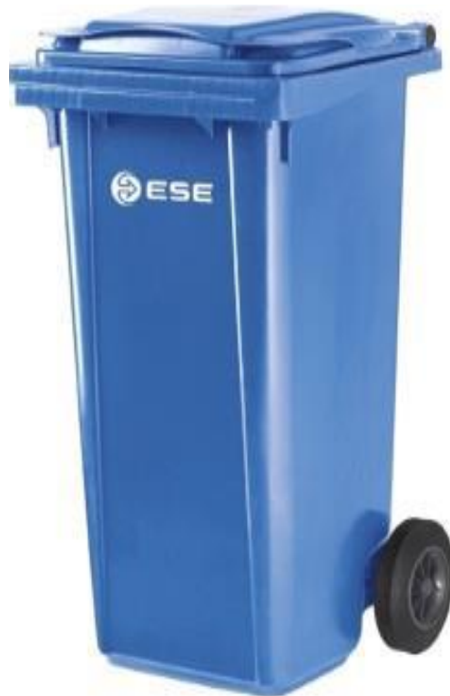
Mixed waste 2x/month