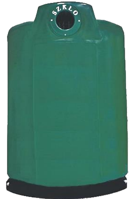
Glass min. 2x/month max. 1x/week