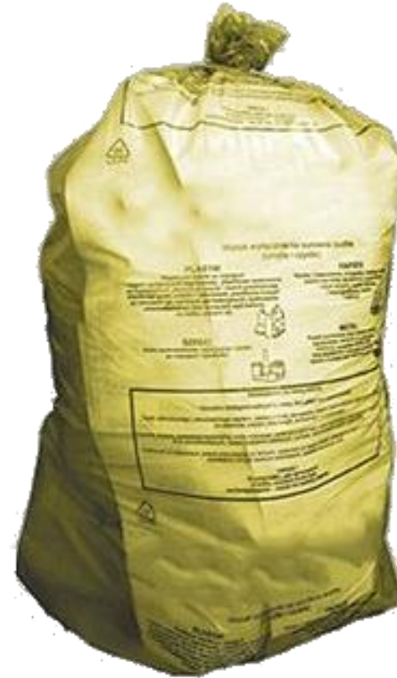
Selective waste 1x/month