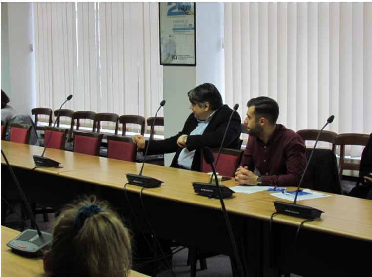
ICI Bucharest General Director