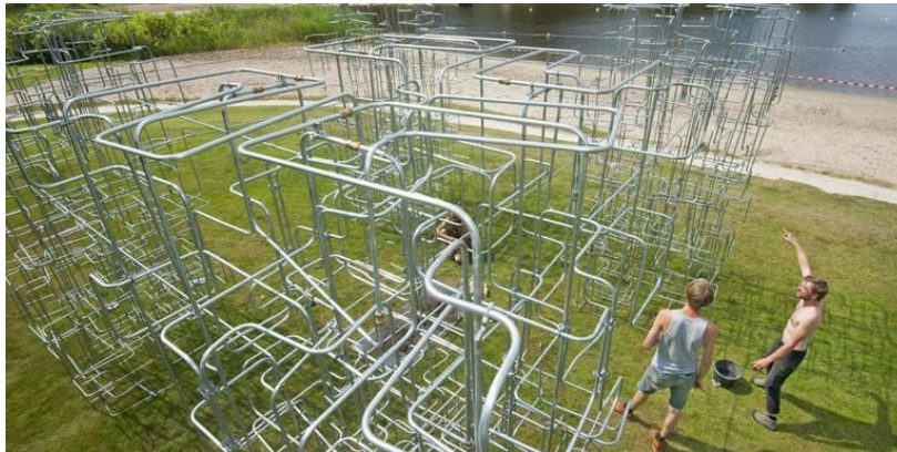
Welcome to the Village 2016