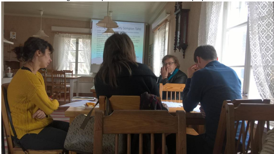
Picture 2 Visiting Sompion Tähti