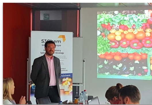
Presentation of the "Verdir" project

Metallurgy has a long lasting industrial tradition in Wallonia. In the framework of the Marshall Plan, about € 41.5 million are invested on the "Reverse Metallurgy" project . The project is bringing together different Walloon partners from different fields working together in order to develop techniques that allow better recycling of metals. The GeMMe Group of the University of Liège and the Comet Treatment and Citius Engineering in particular collaborate on the development of an acquisition bench that is intended to the characterization of metallic shredder residues for recycling purposes. These measures will allow a real-time high speed classification of different metallic items identified by the sensors of a running machine.