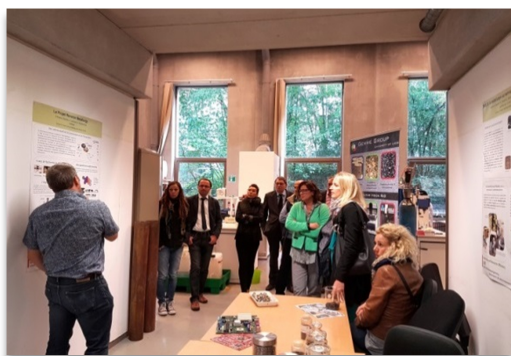
Site visit to GeMMe's laboratory

Another important component of the partner meeting was the introduction to two innovative concepts from the Walloon chemical industry. All attendants had the opportunity to learn more about the mission and activities of the "Reverse Metallurgy" project and the "Verdir" initiative. Both projects are already financed by the Walloon government with funds from ERDF in the framework of RIS benefiting several actors from academic and industrial environment.