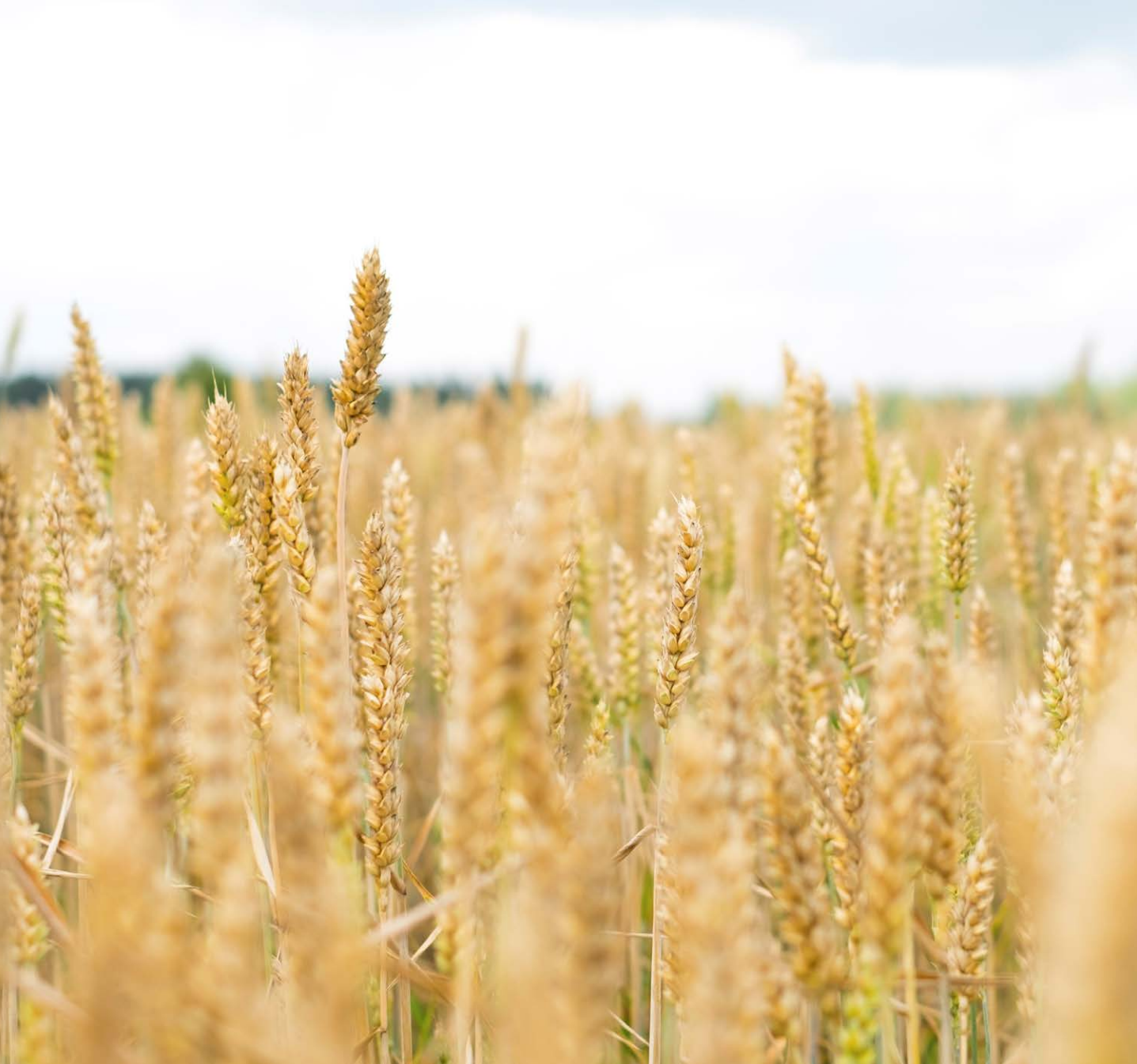
Figure 3. The Päijät-Häme Grain Cluster - BIOREGIO Good Practice of local grain value chain including the farmers.