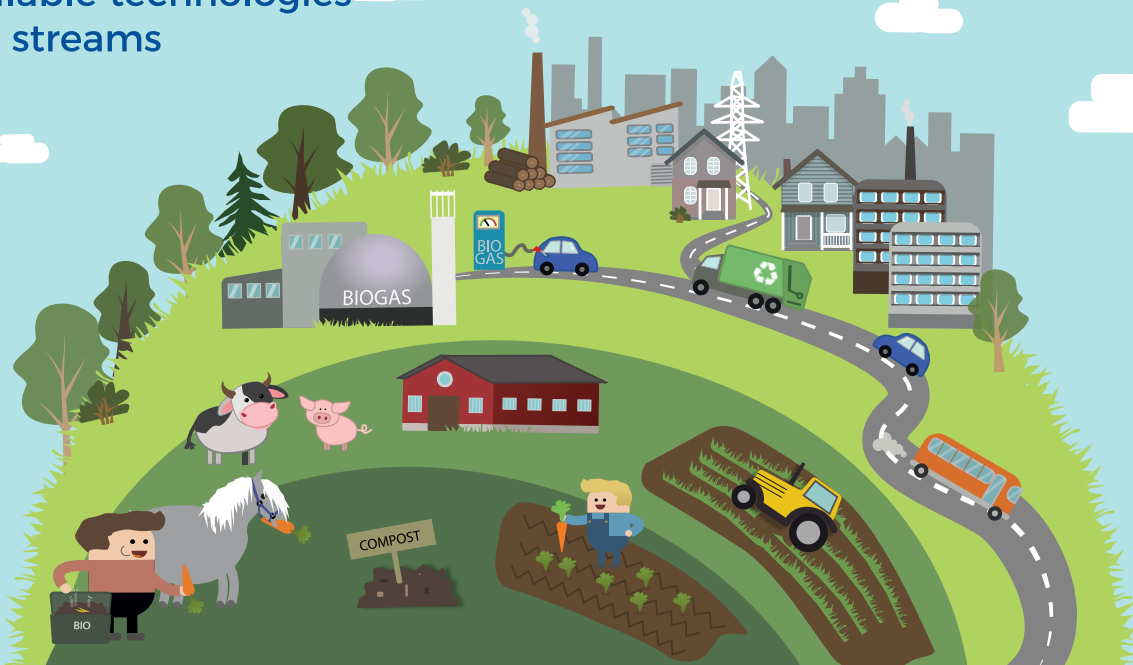
Figure 1. BIOREGIO aims to share good practices in bio-based circular economy. (made by Oona Rouhiainen 2017)