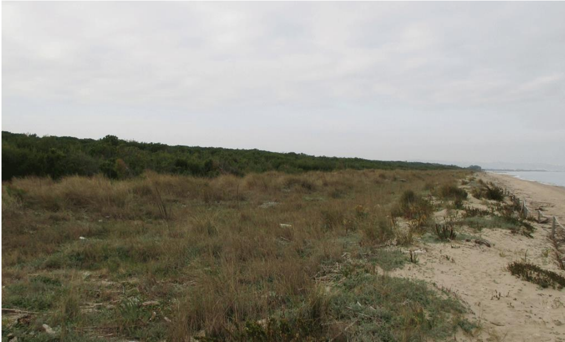
View of the Petacciato pine forest from the beach.