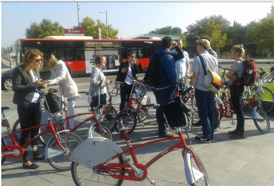
Picture from Meeting, which was held between 17. and 18. October 2017 in Zaragoza, Spain.

On 17. and 18. October 2017 the project meeting for DEMO-EC project took place in Zaragoza (Spain).