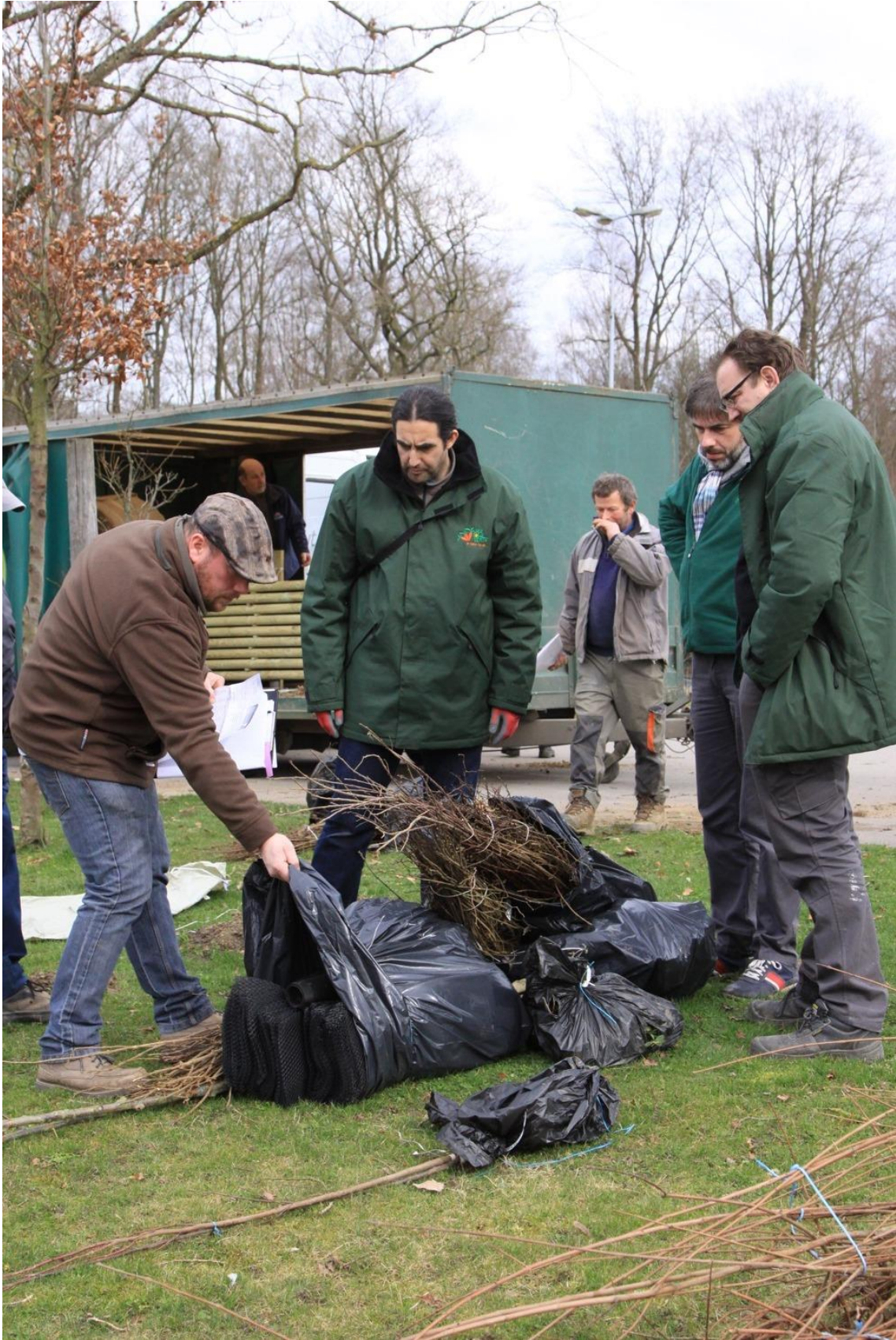
One of the activities of the Plantons le Décor initiative