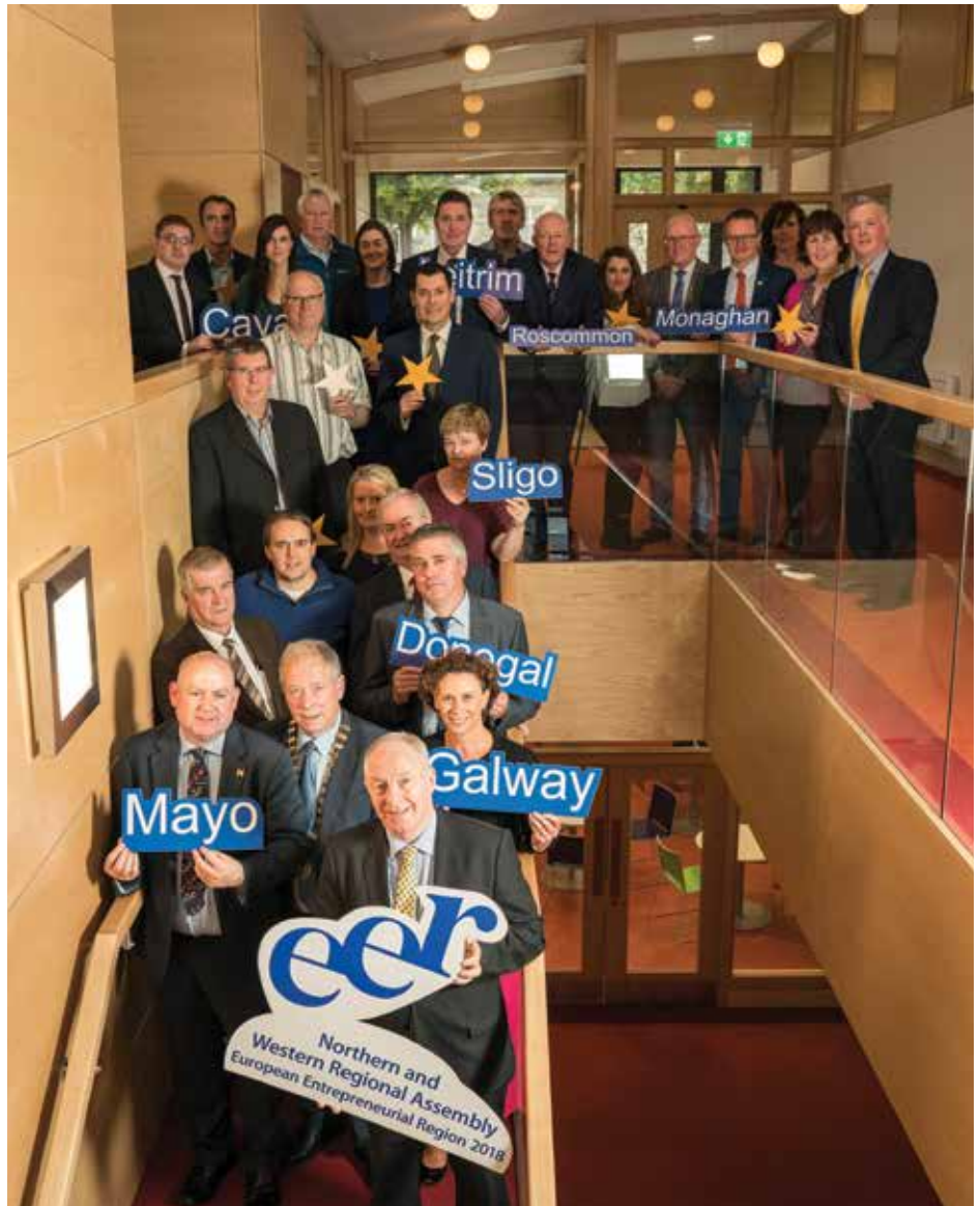
Regional Assembly members from Donegal, Mayo, Galway, Sligo, Roscommon, Leitrim, Cavan and Monaghan, pictured at the presentation of the award with Minister Michael Ring.

Adding the European Entrepreneurial Award is another example of how a region can collaborate effectively. Over the past year the Regional Assembly Members have developed a clear focus, emanating from the conference in late 2016 titled ‘One Region One Vision’.