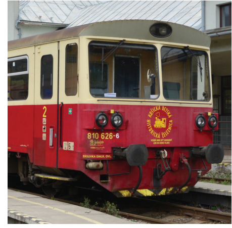
Event train within the Košice region

Raise awareness on sustainable transport within general public and also within local stakeholders and decision makers.