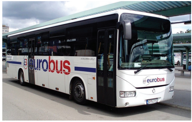
Seasonal bus in Slovenský raj

In the frame of the LAST MILE project, the analysis of framework conditions and barriers identified the potential main issues hindering the implementation of flexible transport systems (FTS) in the aspect of regulatory, institutional, economic and other framework conditions and barriers. The most important in Košice region are legislative barriers: flexible modes of transport cannot be financed from the public funds. Another obstacle is the absence of integrated transport organizer, which would be an ideal coordinator for the implementation of flexible modes of transport.