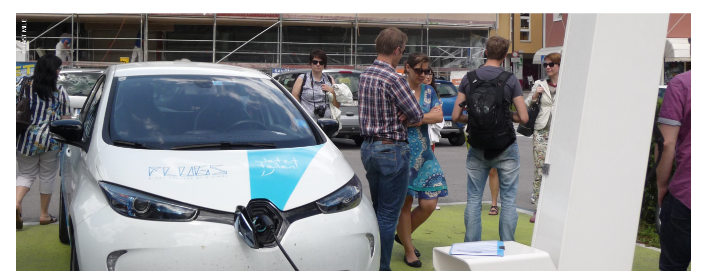
LAST MILE Study Visit to the FTS «FLUGS E-Carsharing»

LAST MILE – Let's travel the last mile together!