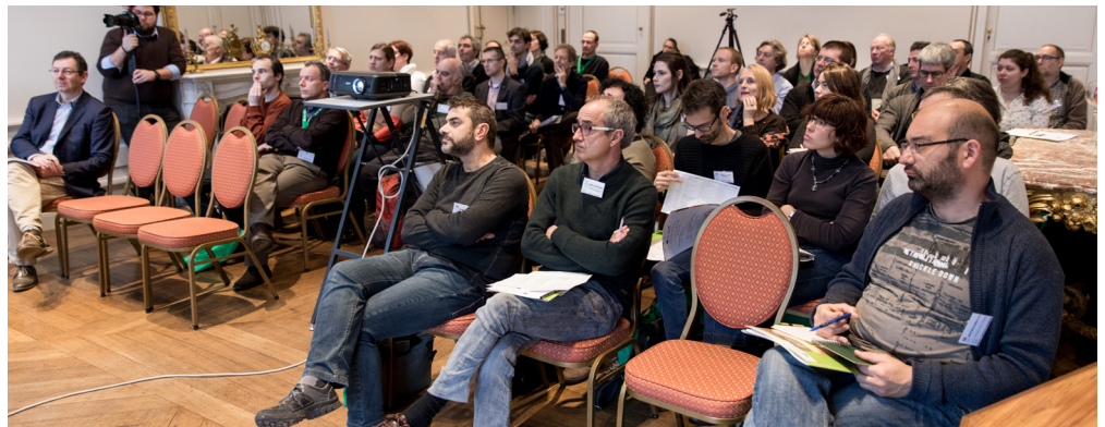
Attendees at the first interregional BID-REX workshop in Namur, Wallonia

There are combined extrinsic and intrinsic factors that can boost the impact of biodiversity information in decision-making processes, including the development and use of 'think tanks', the communication of the value of habitats, species, and ecosystem services, and the improvement of information flows between researchers and public administrations.