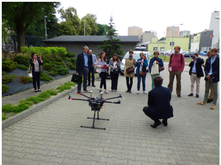
Eko Patrol GIG - City of Lille, June 2018