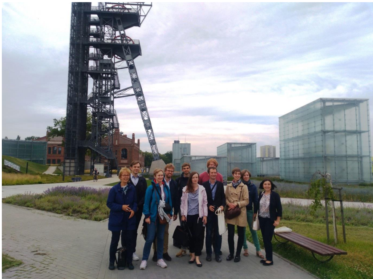
MOLOC partners (GIG, 14/06/18)