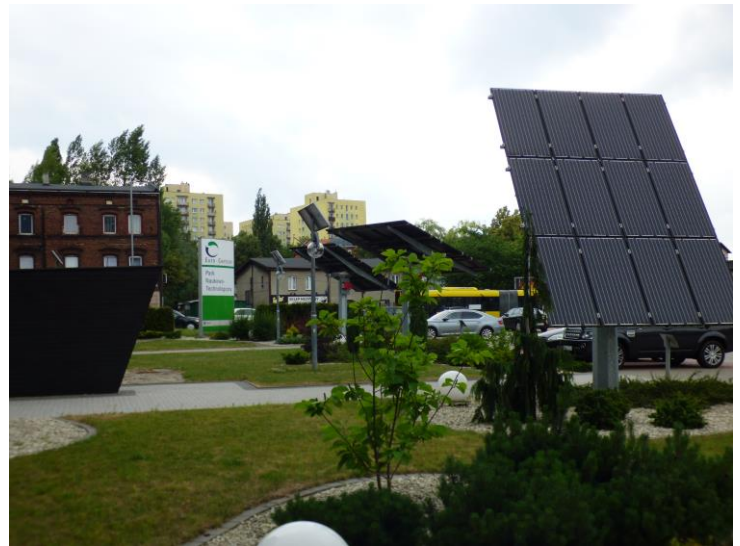
Technology Park Euro-Centrum - City of Lille, June 2018

One of the biggest challenge was to find constructors able to provide efficient technologies such as 300 KWh photovoltaic panels.