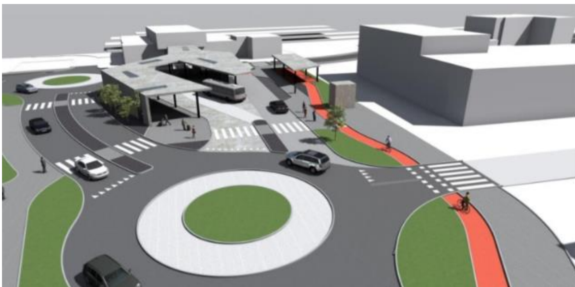
City of Katowice, 2018

“Ligota” transport hub is part of the four transport hubs, planned in the City of Katowice. The objective of the hub is to improve the use of public railway and bus transport and facilitate the flow of private car and bicycle transport.