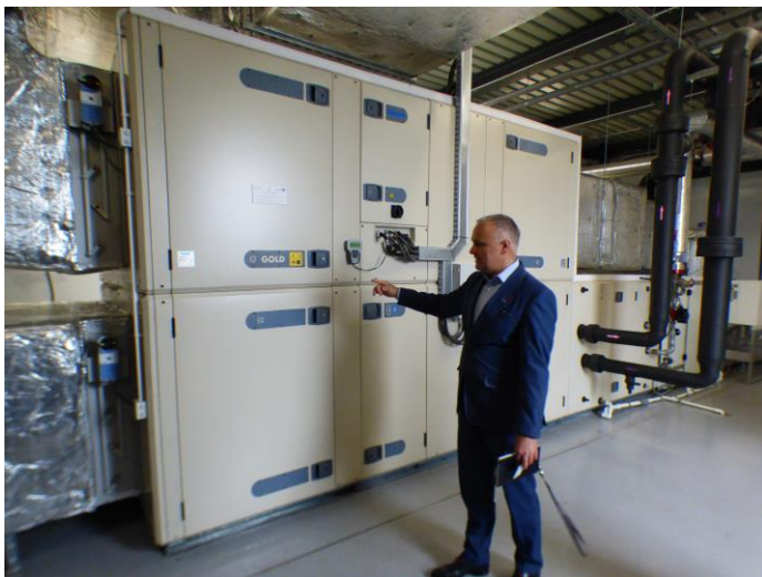
GPP Business Park – trigeneration system (City of Lille)