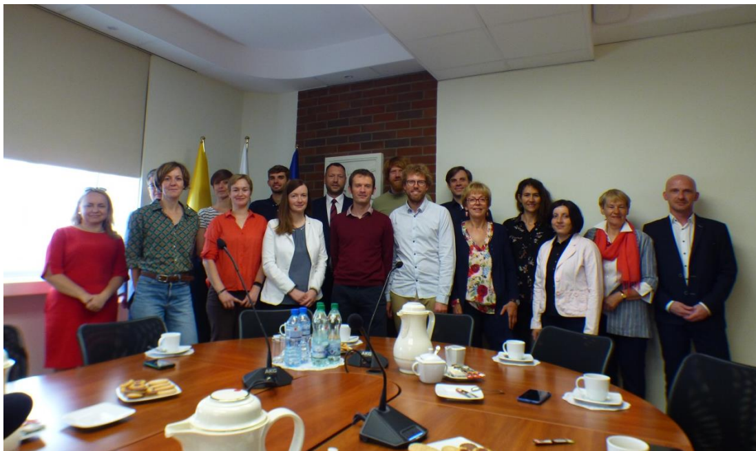
MOLOC partners, local stakeholders and Mariusz SKIBA deputy mayor of Katowice - 14/06/2018