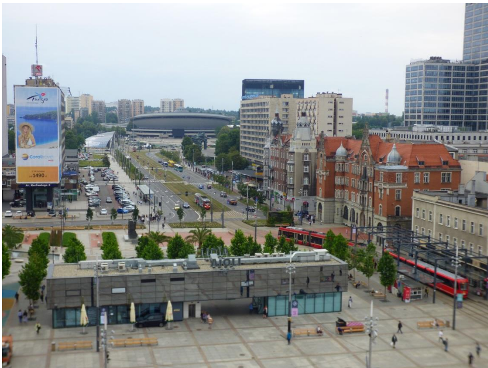
Katowice main square (City of Lille)