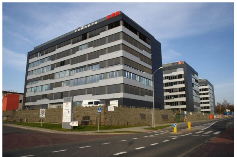
GPP Business Park - http://www.katowice.pro/na-razie-nie-bedzie-rozszerzenia-aranic-ksse-w-katowicach/

In 2012, one of the building has been certified BREEAM (Building Research Establishment Environmental Assessment Method = method of assessing, rating, and certifying the sustainability of buildings). The building is not only environmentally friendly but also cost-effective. Energy consumption in building is about 40-50 % less than in typical A class office buildings.