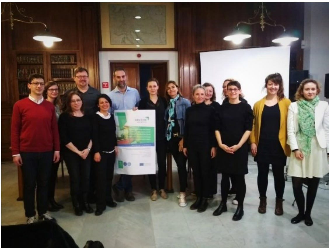
Picture from Meeting, which was held between 12. and 13. April 2018 in Genova, Italy.

On 12. and 13. April 2018 the project meeting for DEMO-EC project took place in Genova (Italy).