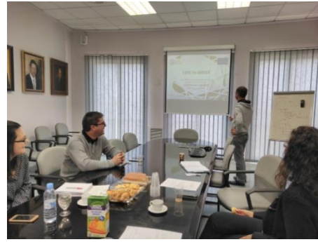
LIFE in Brief explanation

During the second day, the Valencian Network of Technical Institutes (REDIT) was visited. In REDIT, the Enterprise Europe Network (SEIMED) was shown. SEIMED is a network to help SMEs develop their full potential and innovative capacity through internationalization, technology transfer and access to finance.