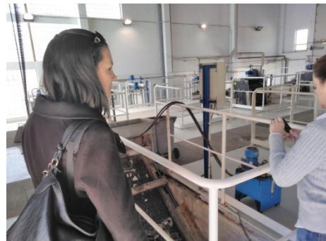
Urban Water treatment facility

During the third day the IVACE site (the other TRIS Valencian Partner) was visit. In this part the thematic areas in the IVACE that match the objectives of the TRIS project were shown, such as: