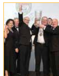
LAMA Awards Page 59