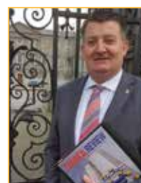
AILG President Page 33