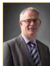
NOAC Report Page 133