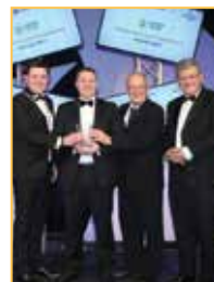
Offaly County Council Page 111

Public sector employees are five times more likely to experience violence than employees in other sectors, according to the findings of a new study, which reveal the scale of the issue for the first time in Ireland.