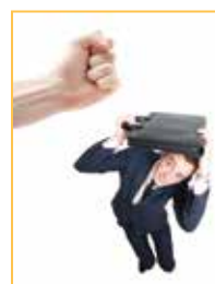
Health and Safety Page 158