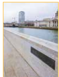
DCC Flood Protection Page 117