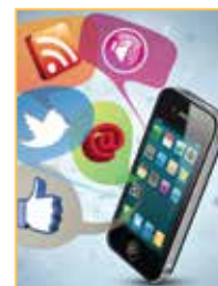
Communications Strategy Page 120