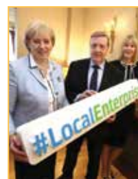
Local Authority Forum Page 71