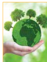
Green Procurement Page 40