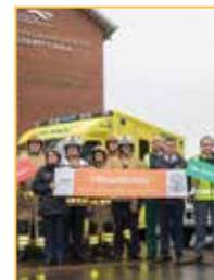
Road Safety Page 125