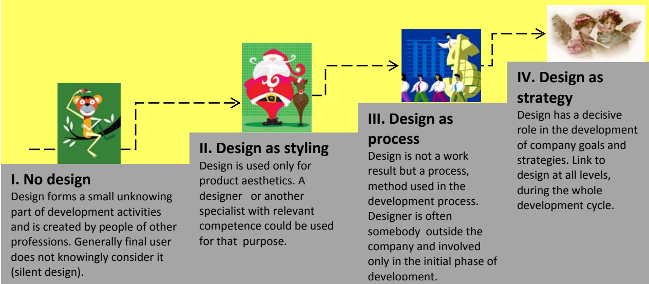
Figure 1: How companies use design – design ladder