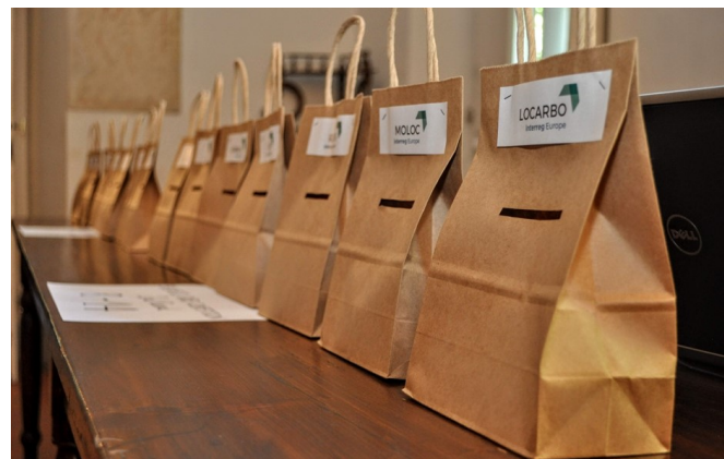
Participants, after hearing a variety of business cases presented by 14 different low carbon Interreg Europe projects, anxiously await to hear the winner of the competition.

A major highlight of the Interregional Cooperation for Europe's Energy Transition was the Business Case Competition —a challenge between 14 different low-carbon projects to come up with the best business case for Europe's energy transition.