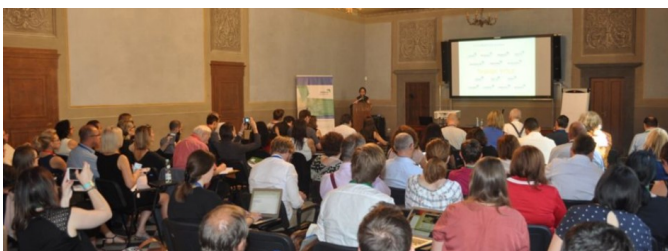
Interregional Cooperation Event for Europe's Energy Transition in Florence, Italy. 27 July 2018.

VIOLET , alongside likeminded EU-funded projects with an interest in improved policy for the European energy transition— REBUS , SET-UP , BUILD2LC , ZEROCO2 , BIO4ECO , etc.—engaged in a cross-borders interregional cooperation event this summer to address common challenges and goals related to the energy transition in Europe.