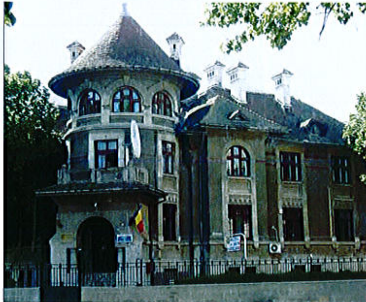
Museum of Ethnography and Folk Art in Tulcea

technical equipment in line with the current quality requirements. The building is a historical monument, ranked in the List of Historic Monuments in Tulcea County (2010) at no. 480, code TL-II-m-B-05971, entitled " Former Headquarters of the National Bank of Romania " and did not benefit from capital restoration works.