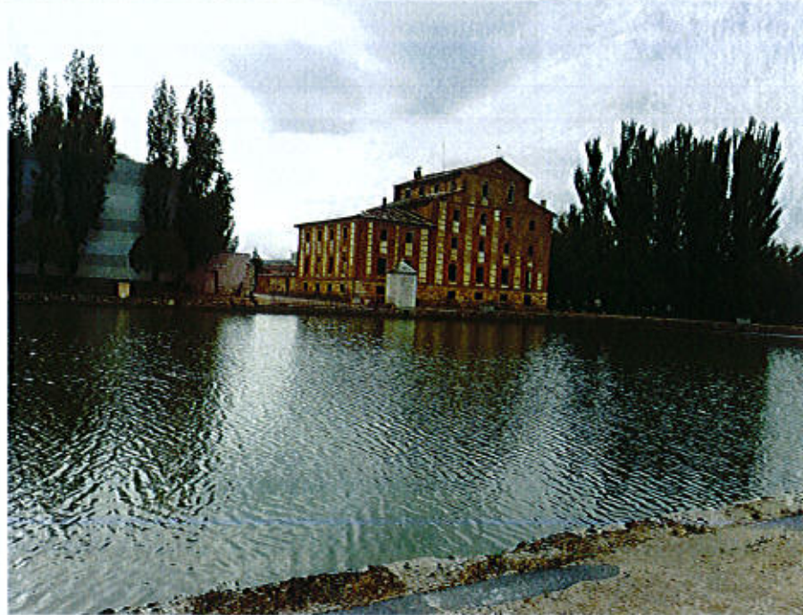
Castilian Waterway and San Antonio Flour Factory

This model of good practice is relevant to Tulcea through: how to involve different public authorities to find solutions to improve the cultural infrastructure in the surrounding landscape of a navigable canal; the rehabilitation of heritage buildings, their use as spaces for the development of cultural and social activities and the provision of tourist services to potential tourists and visitors.