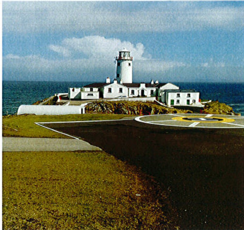
Fanad Head Lighthouse

This practice is inspiring by how the revitalization of cultural heritage and the promotion of local cultural heritage in a remote coastal area can bring social and economic benefits to the local community. This lesson inspired us to choose the Old Lighthouse in Sulina as a cultural objective to be revitalized, by creating cultural activities that will bring added value so that the coastal area becomes a tourist attraction with a particular specificity. We expect that the restoration, valorisation and promotion Old Lighthouse in Sulina will have a positive impact on the local economy and would boost touristic experiences throughout the year in the city of Sulina, which faces similar problems to the Irish community in Fanad Head, namely: a small range of economic activities, lack of jobs, depopulation and seasonality of tourism.