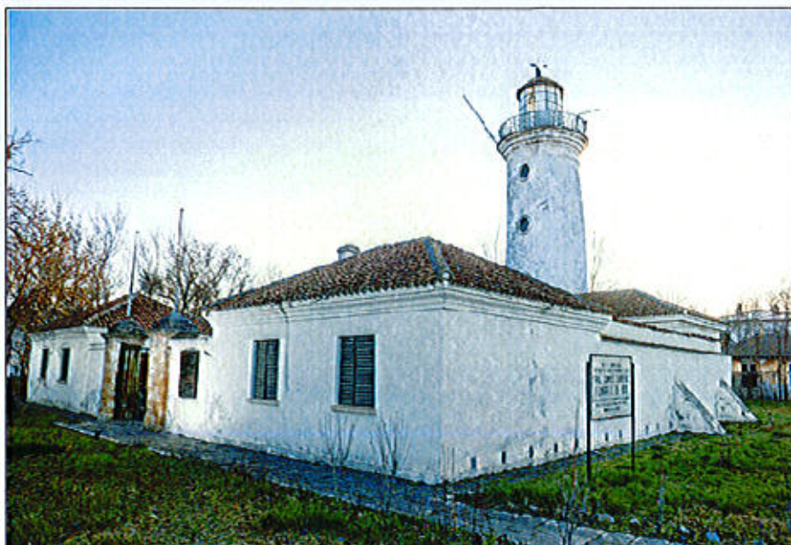
Old Lighthouse in Sulina

hydrostatic level), as well as some deficiencies in putting into operation or constructive solutions adopted during the restoration.