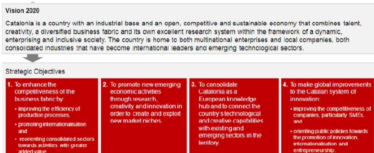
Fig. 1. Strategic objectives RIS3CAT

The following pictures show the strategic objectives and the four pillars of RIS3CAT: