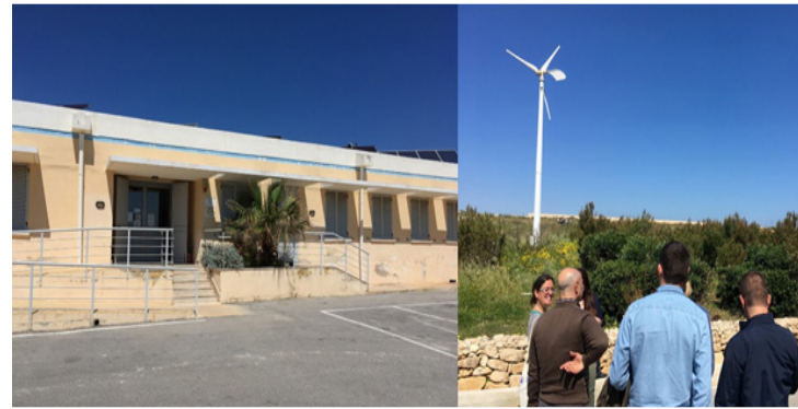
Picture 1. Left-Main entrance to the Sustainable Development Centre; Right-demonstration of the RES around the Centre

The first good practice we visited was the X'robb l'Ghagin Sustainable Development Centre that is located in the locality of Marsaxlokk. It is a former military station situated inside a Nature Park, which was refurbished into the Sustainable Development Centre and hostel for school groups as a result from one EU project in 2011. The Centre conducts education and trainings on the topics of renewable energy sources, energy efficiency and innovative solutions for the use of wind and solar energy, natural lighting, recycling and the use of wastewater.