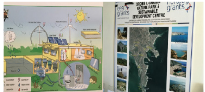
Picture 2. Left-types of RES and EE systems in use; Right-Area of the Development Centre