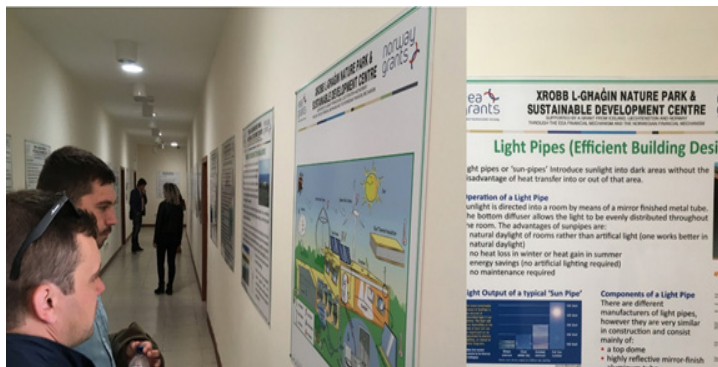
PICTURE 3. LEFT-BEST PRACTICES EXPLANATION BOARDS; RIGHT-LIGHT PIPES (VISIBLE ALSO IN THE LEFT PICTURE) AS A INTERESTING SOLUTION