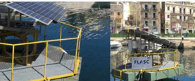
Picture 4. Left-The FLASC system in the Grand Harbour; Right-University of Malta representative explains the working principle

The FLASC dual-chamber technology allows the operating pressure range to be established independently of the deployment depth. It exploits existing resources and infrastructure, resulting in a cost-effective solution, beating batteries at their own game.