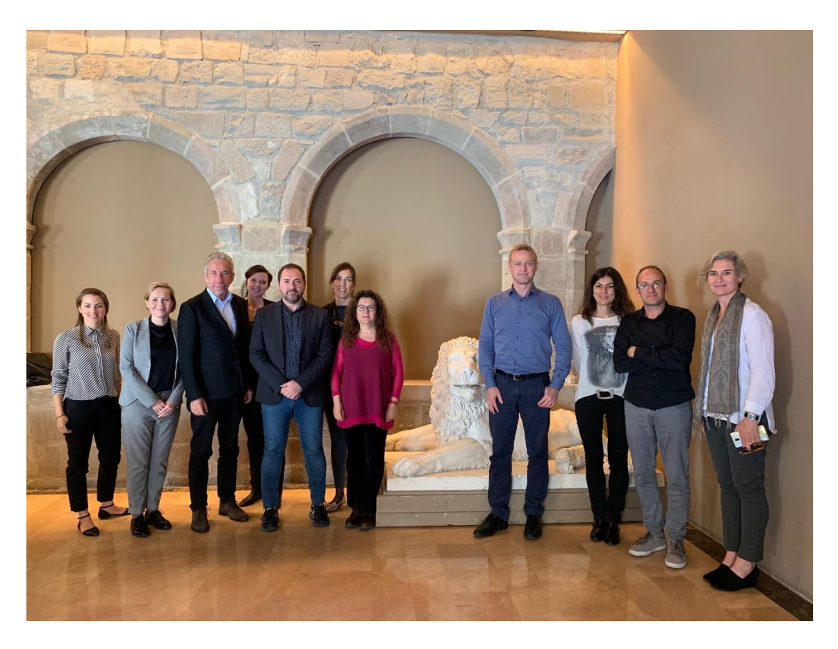
On Staff Exchanges and Learnings

Lights, camera, action! From Austria to Italy to support the film industry In November 2018, Austria's Film Industry Support (FISA), which is embedded in aws, visited the South Tyrolian partner IDM Ecosystem Film & Creative Industries in Italy more than once. Read about the highlights from the visit here.