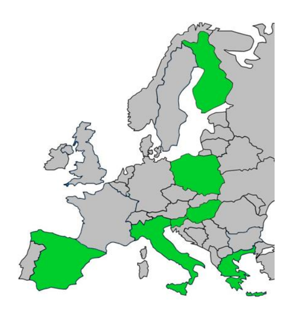
Figure 1: SYMBI regions

Circular Economy is an economic system where products and services are traded in closed loops or 'cycles'. A circular economy is characterized as an economy which is regenerative by design, with the aim to retain as much value as possible of products, parts and materials. This means that the aim should be to create a system that allows for the long life, optimal reuse, refurbishment, remanufacturing and recycling of products and materials.