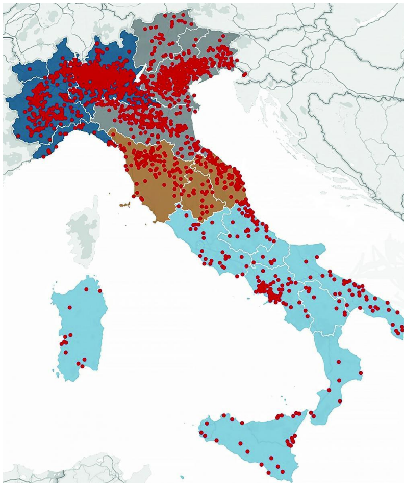
Figure 2 Italian medium-sized companies: location in 2016