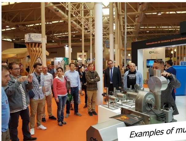
Examples of multi-fuel heating systems