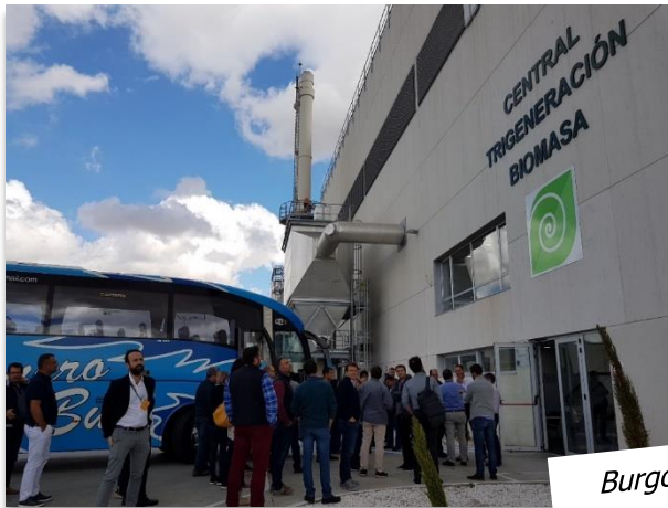
Burgos trigeneration biomass plant

The project partner EREN (Regional Energy Agency of Castilla y León) organised numerous site visits around the bioenergy theme, including technical visits to Burgos industrial sites and to the biomass district heating in Valladolid, and a guided technical tour to the Expobiomasa fair.