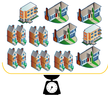
Global Collection Profile by Zone

Total weight collected from one (or more) circuits for each flow