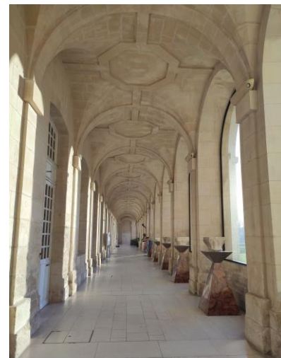
This aisle won't see the APPROVE partners walking in #COVID-19 / stay safe

And, we hope that our good practices will spread all over Europe and makes benefits for citizens, public authorities and project holders... when all this pandemic will be over 😊