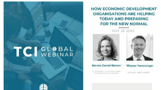
New Innovative Normal