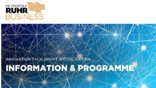
RIS3 Clusters and Innovation