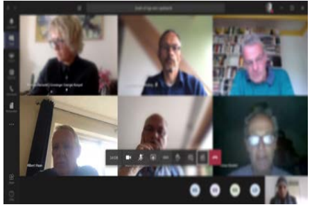
Dutch energy cooperatives and other stakeholders in the Northern Netherlands discussed how to improve policies and financial instruments for energy transition [more..]

Reducing transport greenhouse gas emissions, by promoting infrastructure for energy-free road transport vehicles [more...]