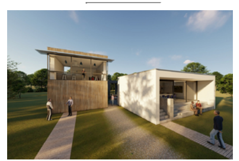
The subsidy of €40,000 comes from a subsidy scheme that focusses on innovative and sustainable SMEs [more...]