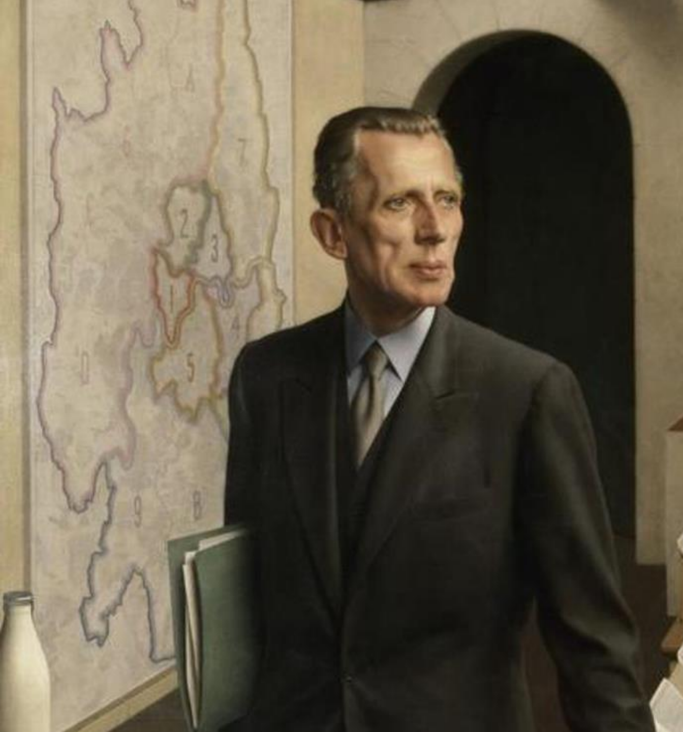
Sir Ernest Gowers