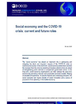
Social economy and the COVID-19 crisis: current and future roles