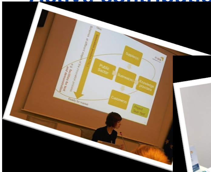
PLP workshops in Milano and Hamburg