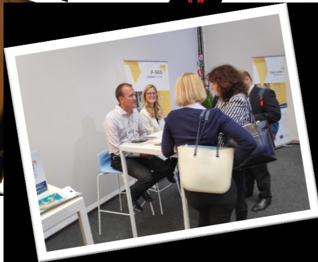
Peer review for Vestland County