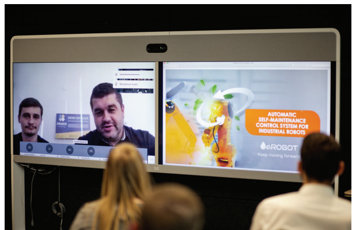
Snapshot from the virtual Bootcamp, October 9th