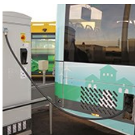
The benefits of