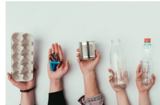
Responsabilitatea extinsă a producătorului