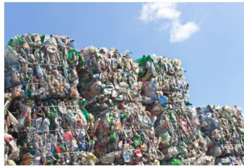
Piața pentru Materiale pentru Reutilizare

Companies and research institutions from countries in the Danube region can exchange products, materials and resources for reuse and build cooperation networks to promote a circular economy.