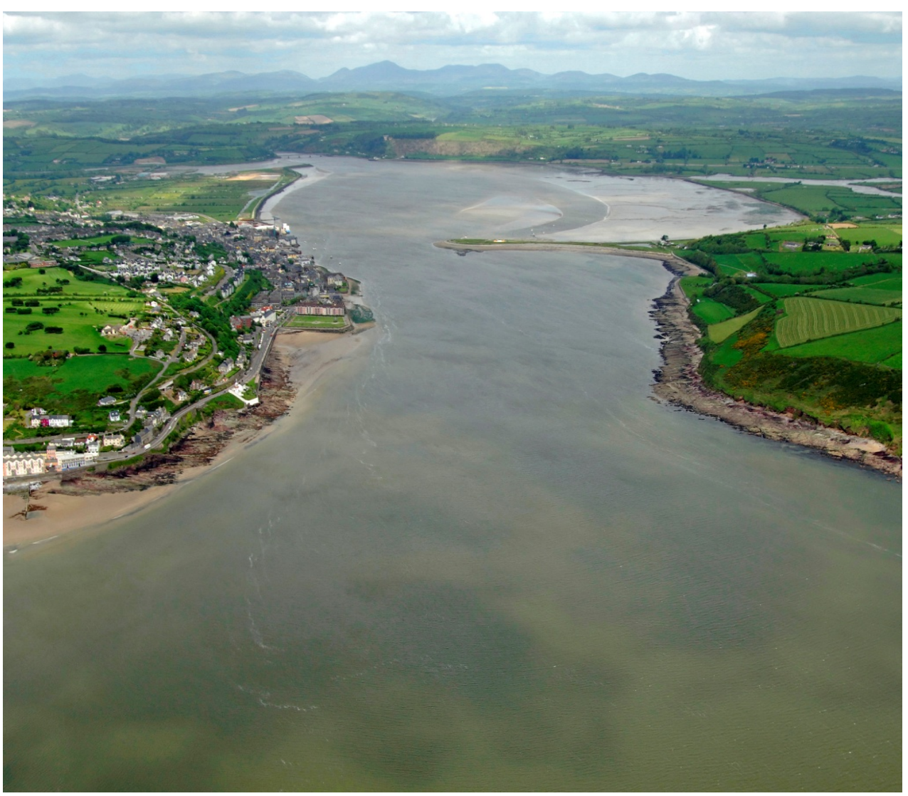
Figure 4: The River Blackwater Estuary

In terms of water quality, based on a recent Environmental Protection Agency (EPA) assessment paper on the Munster Blackwater Catchment (2018)<sup>5</sup>, the catchment has 158 river water bodies of which 52 are at risk of not meeting Water Framework Directive (WFD) requirements. A number of Areas for Action (8) within the catchment have been identified during a Catchment assessment carried out as part of the River Basin Management Plan cycle (2018-2021). The significant pressure affecting the greatest number of river water bodies in the catchment is agriculture, followed by forestry, hydromorphological pressures, urban wastewater, other pressures (unknown and waste), industry, diffuse urban, mines and quarries, and domestic wastewater. In the Lower Blackwater Estuary, there is an increasing trend towards elevated nutrient loads with agriculture identified as the main pressure. However, measures to improve water quality in the catchment to address nutrient loading to the estuary have demonstrated positive effects<sup>6</sup>.