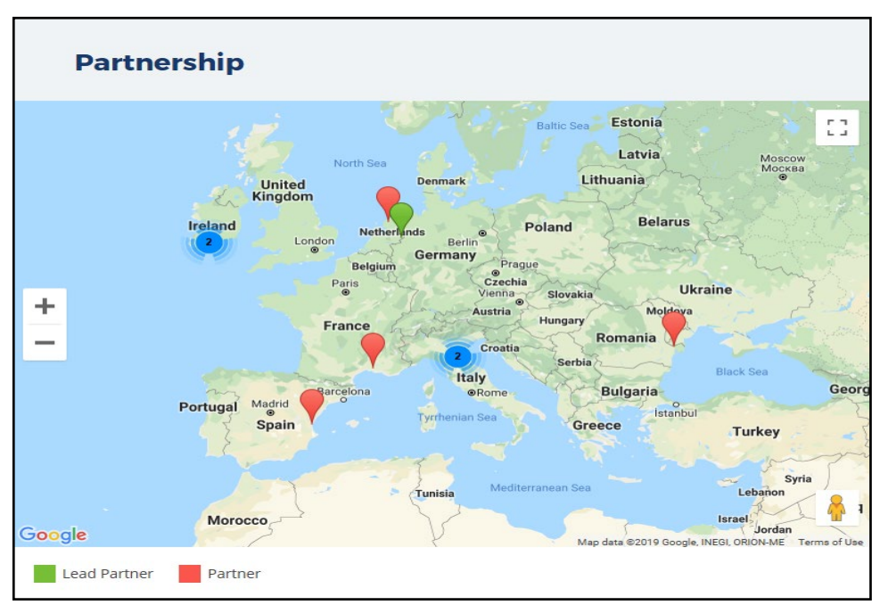
Figure 1: Mapped illustration of project consortium members

The project focuses on a number of river delta regions in Europe with an overall aim to improve regional policy instruments to both protect and utilise ES in these areas and to strengthen their regional economies. There are nine partners involved in the project from six different Delta regions in Europe (see mapped illustration in Figure 1 below) including partners from the Netherlands (Rijn Delta), Italy (Po Delta), Romania (Danube Delta), Spain (Albufera Delta), France (Rhone Delta) and the River Blackwater Delta in Ireland.