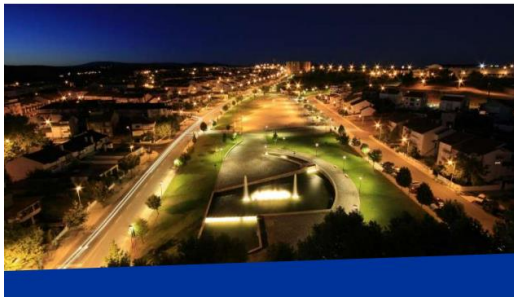
EURE STATE OF PLAY REGIONAL REPORT SPAIN/PORTUGAL