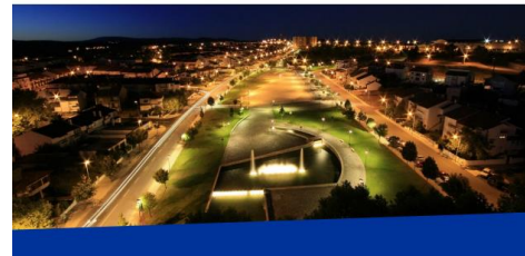
FOR A BETTER AND SUSTAINABLE QUALITY OF LIFE IN EUROPEAN CITIES

Catalogue of policies, actions, good practices and recommendations