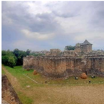
The Princely Fortress of Suceava