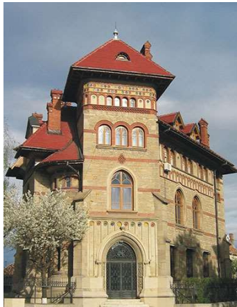
Piatra Neamt Cucuteni Museum of Eneolithic Art