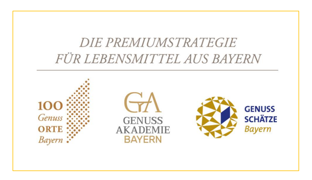
Figure 1 The Three Pillars of the Premium strategy for food

To achieve this goal, there were build up three projects with different approaches. They all have the same overarching aim. These three projects or pillars of the Premium strategy for food are described in more detail below.