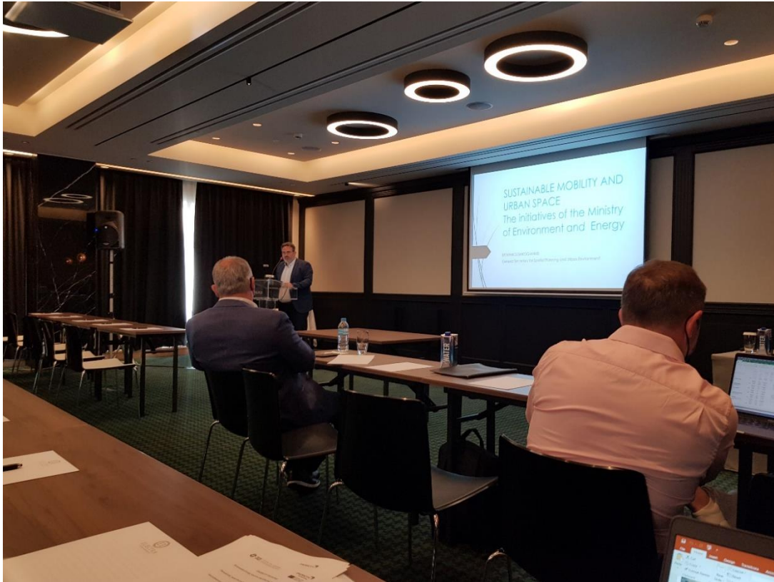
Photo 3: Project workshop - Secretary General Spatial Planning and Urban Environment