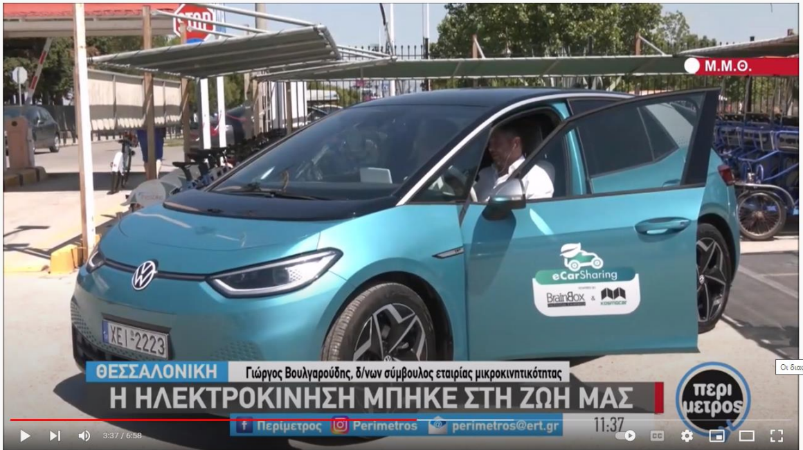
Η ηλεκτροκίνηση μπήκε στη ζωή μας | 11/05/2022 | EPT

European Union European Regional Development Fund