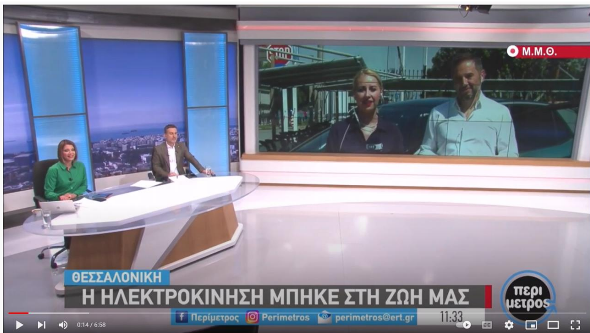
Η ηλεκτροκίνηση μπήκε στη ζωή μας | 11/05/2022 | EPT