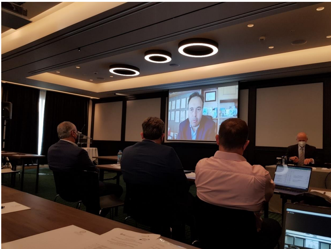
Photo 4: Project workshop – President of the Central Union of Municipalities of Greece