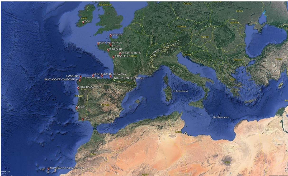
Figure 1. Members of the Atlantic Cities.

Another activity of the European network Atlantic Cities is the promotion of dynamic and direct relations between cities through cooperation with other networks.