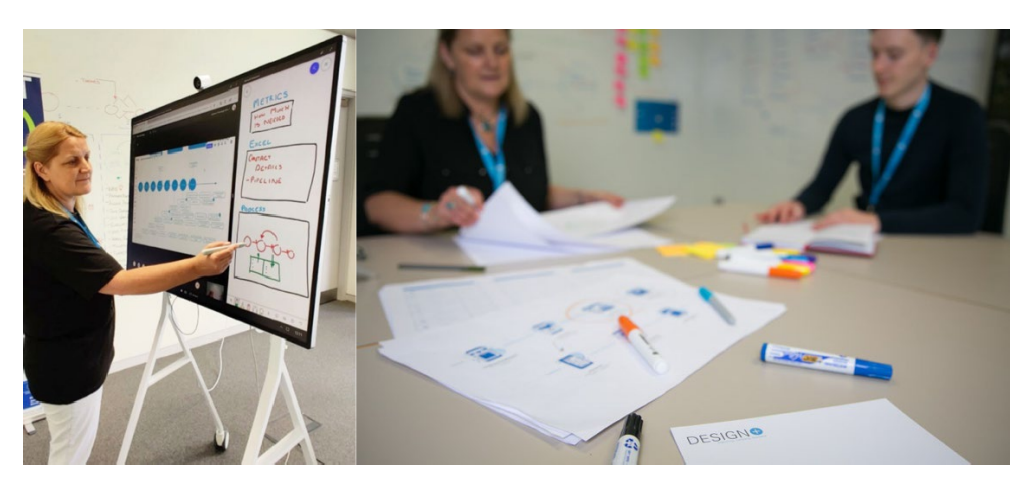
Figure 7& 8: Design team at Design+ Technology Gateways

The action is a bespoke strategically designed programme, developed by stakeholder Design+ Technology Gateway based at the Institute of Technology Carlow, specifically to stimulate innovation in Irish craft SMEs. The proposed programme will consist of a series of targeted workshops (6 masterclasses 2 hours long, final session 1-to-1 between expert and the participant) which will guide craft businesses through a strategic design process utilising a specific design tool kit.