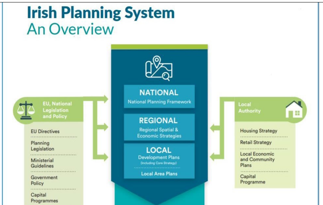
Figure 3: Overview of the Irish Planning System