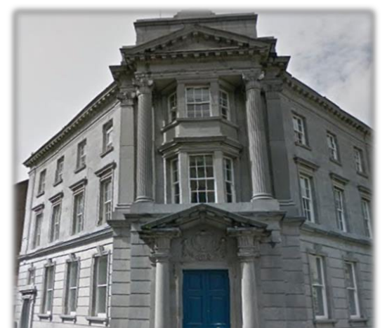
Figure 4: Southern Regional Assembly based in Waterford.

SRA Mission: To be the leader of regional development through effective, sustainable spatial planning and the delivery of EU Programmes, with the support of our stakeholders.