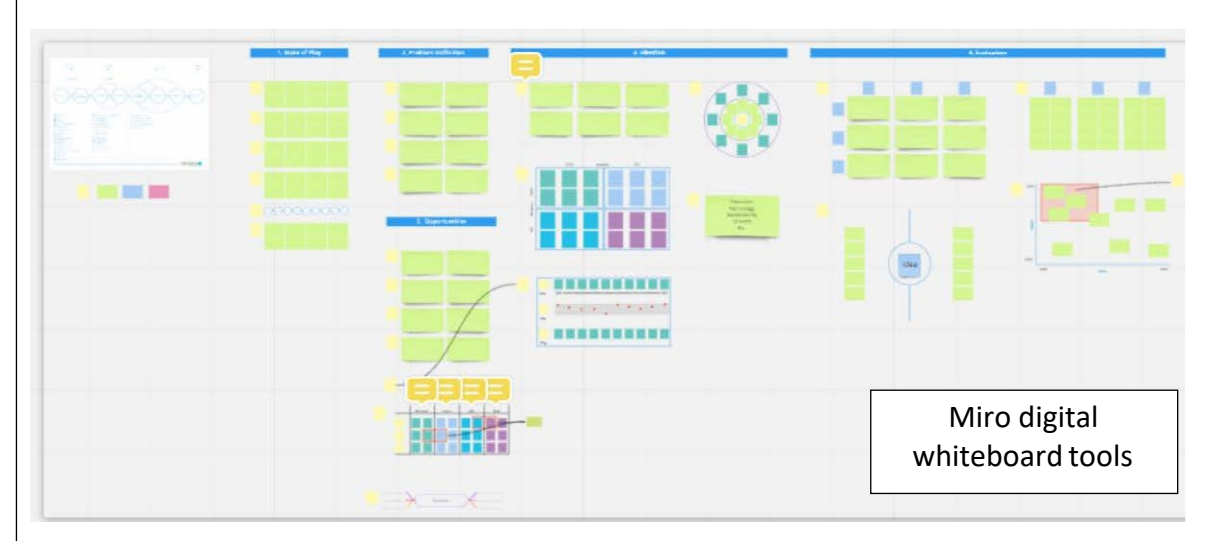
Figure 9: Digital tools which will be incorporated into the innovation programme

Design and Craft businesses will be supported and guided in the development and generation of new ideas and evaluate them through usability, feasibility, and viability to support decision making. This will result in the development of new products/service, new markets, and new ways of doing things for the SME participant.