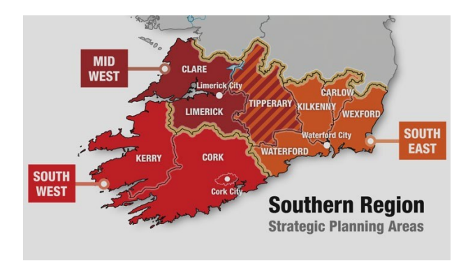
Figure 2: Map of Ireland displaying the different Southern regions.