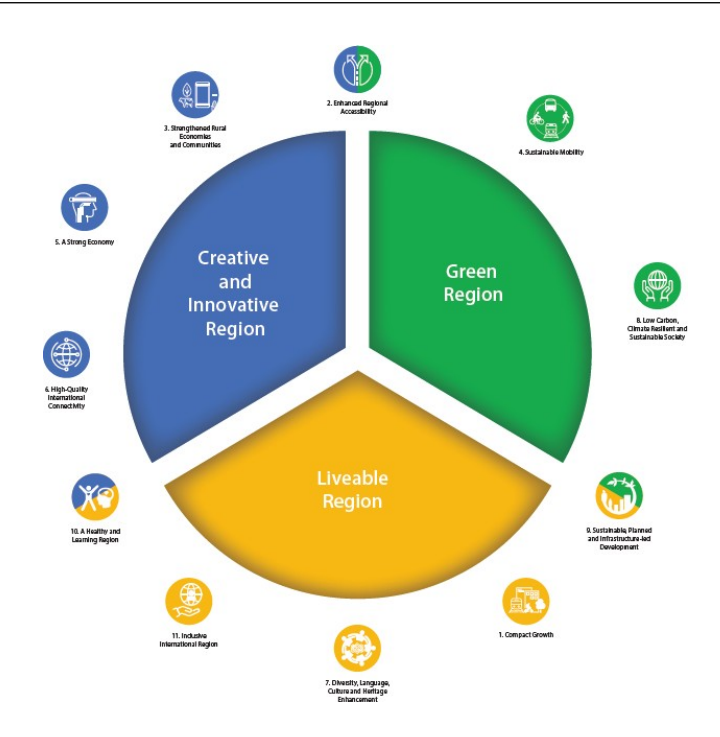
Figure 5: 11 Regional Strategic Objectives that frame the RSES.