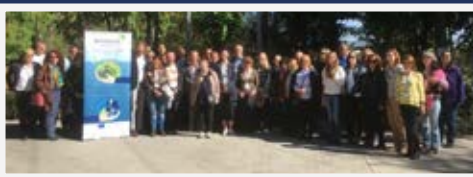
4 th meeting