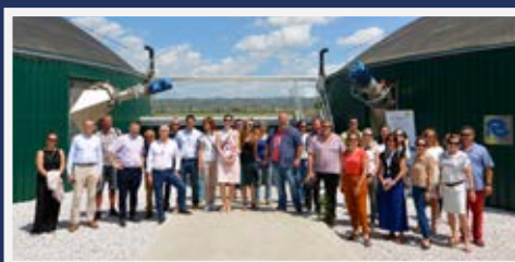
3 rd meeting