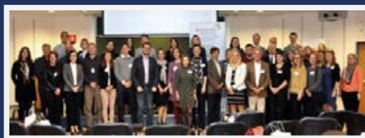
5 th meeting