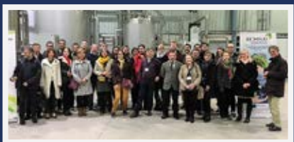
2 nd meeting