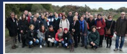
6 th meeting