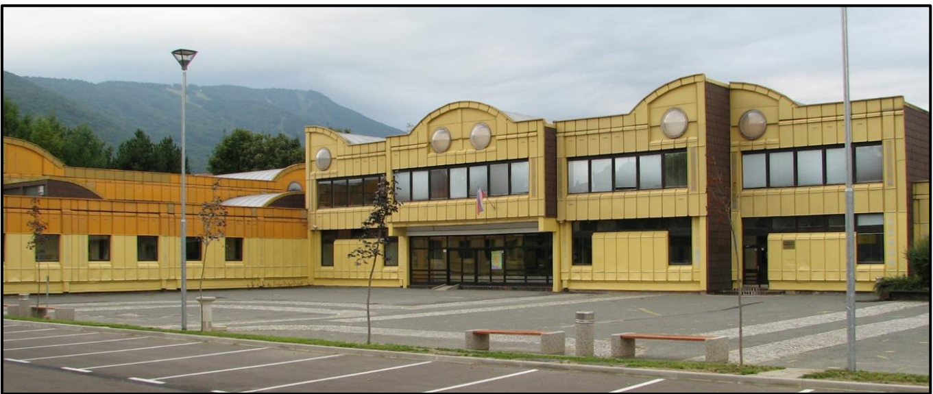
Primary school Tabor I Maribor

Primary school Tabor I Maribor, Municipality of Maribor was successful using Cohesion funds in the amount of 568.360,75 EUR.