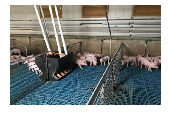
For more information, click the following link: <a href="https://www.cpigfeed.eu/">https://www.cpigfeed.eu/</a>

Totally ~1300kg of bakery meal have been produced and fed on a scheduled experimental basis to piglets.